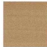
EUROPEAN WILD APPLE

For full colour choice, please contact us.