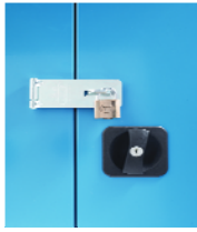
Optional Hasp & Staple