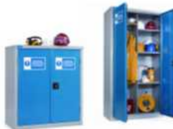
Personal Protection Equipment Cabinets