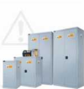
General Cabinets Cabinets